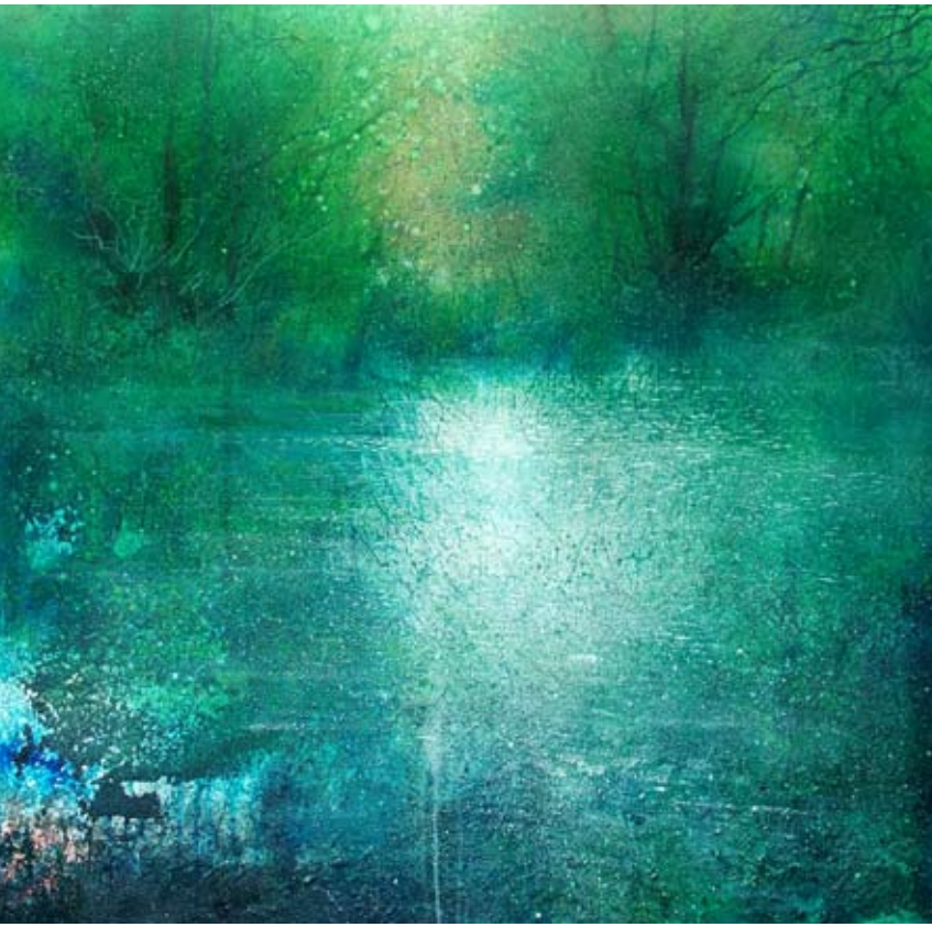
"I've got no preconceived idea of exactly what the painting will be like. It's kind of intuitive"